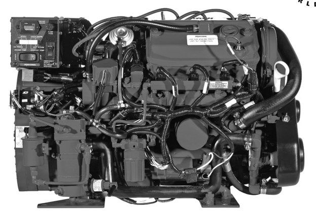
5.0/4.2 MCG Marine Gasoline Generator

Featuring a 3-cylinder engine with a balance shaft that virtually eliminates vibration, the 5.0 MCG is an extremely smooth running 5.0kW. The engine also operates at an electronically controlled 1800 rpm for exceptionally quiet operation. In comparison, 3600 rpm engines are generally noisier than their 1800 rpm counterparts and require sound shields to attain similar noise levels.